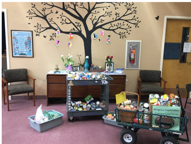
Canned food collected for RE's Easter "Egg" Hunt